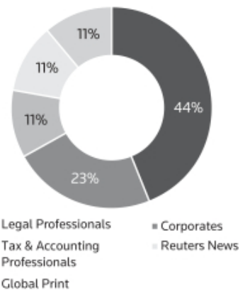
Third-Quarter 2020 Revenues

Provides legal and tax information primarily in print format to customers around the world.